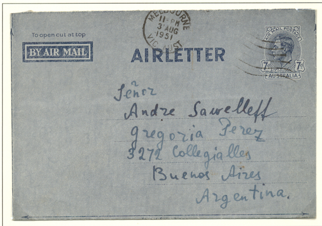
Airletter sent from Melbourne August 3, 1951 to Buenos Aires, Argentina.