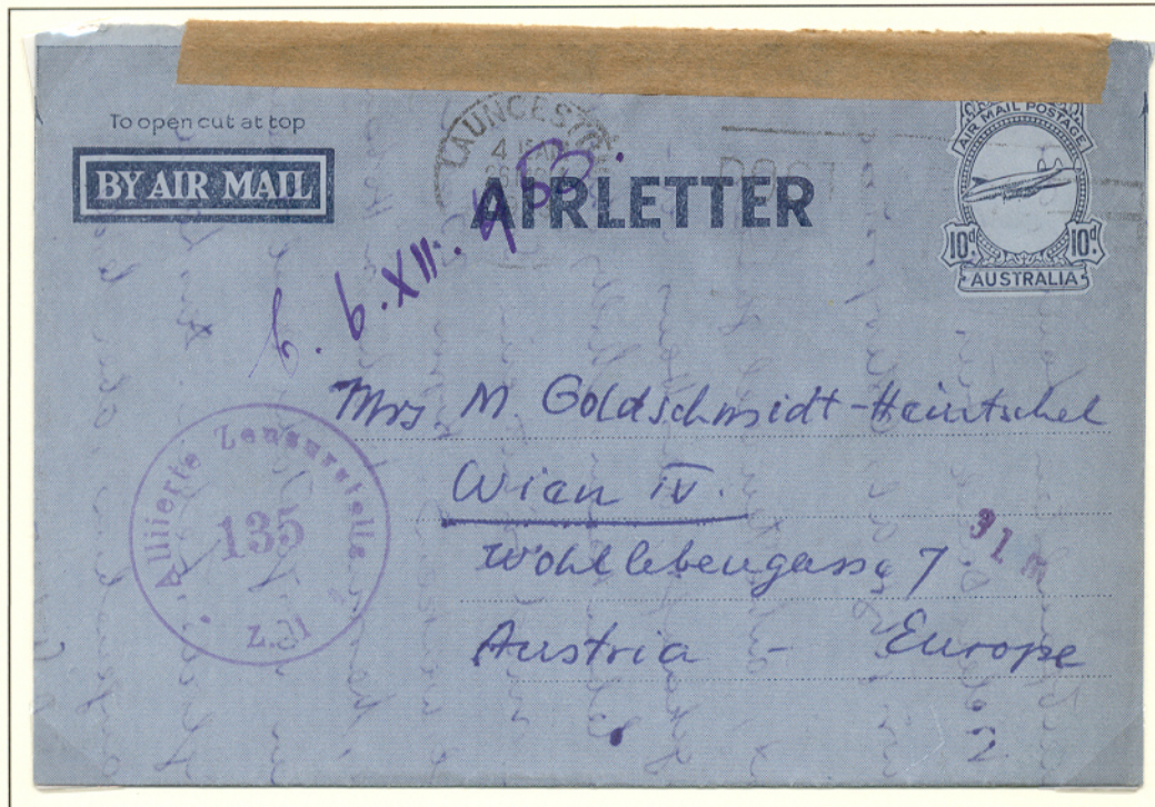
Censored airletter sent from Launceston March 25, 1953 → Vienna, Austria. Censorship 135 = Austrian censorship.