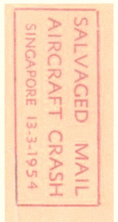
Rectangle cachet in red with text: SALVAGED MAIL AIRCRAFT CRASH SINGAPORE 13.3.1954