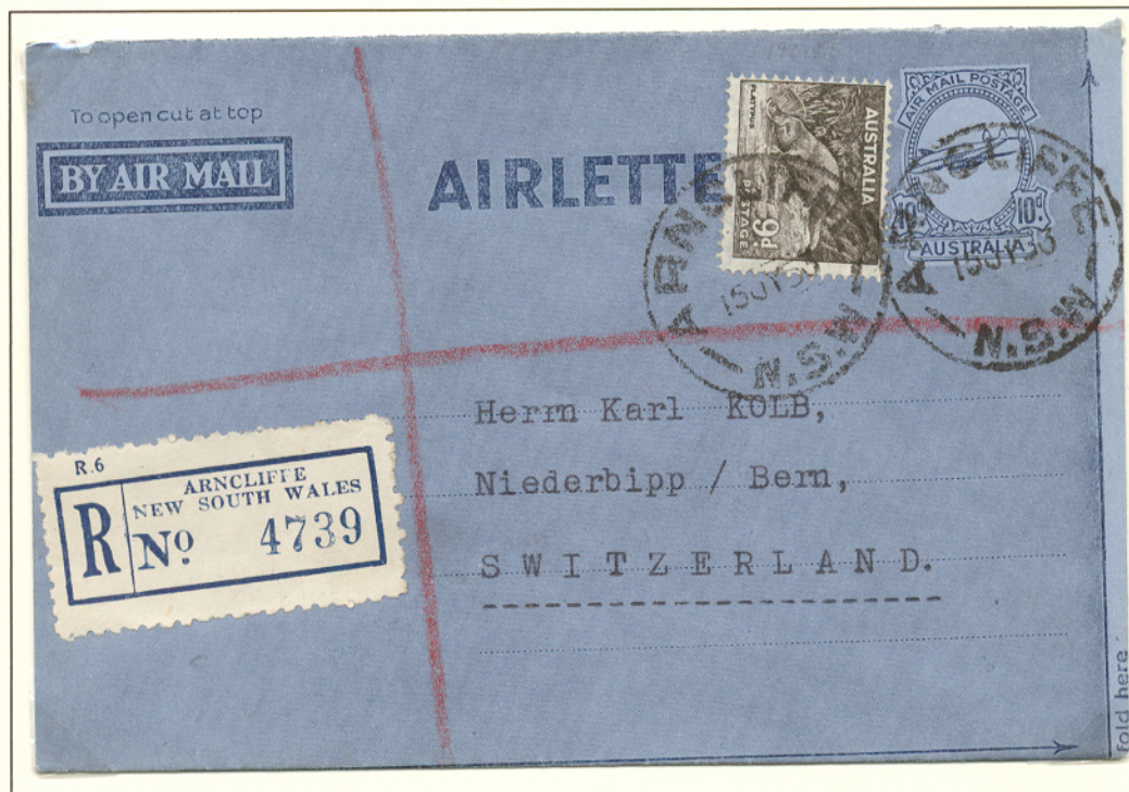
Registered airletter sent from Arncliffe July 15, 1953 → Niederbipp, Switzerland.

Additional registration fee 9 pence; period: July 9, 1951 – October 1, 1956.