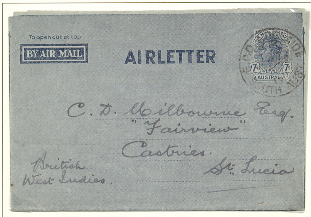
Airletter sent from Adelaide June 4, 1951 to Castries, St. Lucia British West Indies.