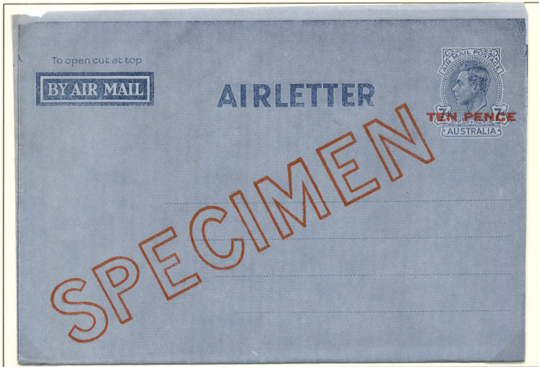
Airletter overprinted in open capitals with SPECIMEN in red, length 105mm, for UPU.

10-pence on 7-pence Head of King George VI. AIRLETTER in one word. Blue overlay and legend now on bluish-grey paper . Provisional air letter. Red TEN PENCE surcharge over value in indicium. First day August 28, 1952.