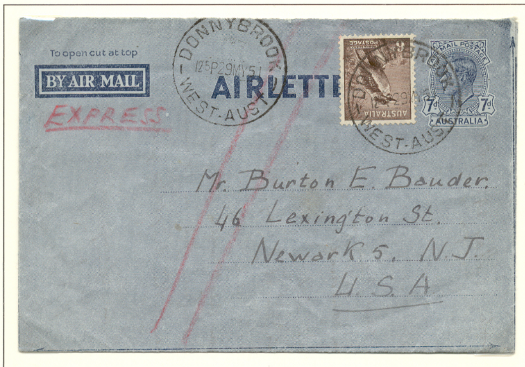
Airletter sent per express from Donnybrook May 29, 1951 to Newark, USA.