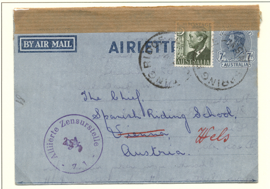
Censored airletter sent from Spring Ridge August, 1952 → Wien, Austria August 27, 1952 redirected to Wels Censor 94 = Allied censorship in Austria

On August 1, 1952 the postal rates for airletters was raised from 7-pence to 10-pence, so additional 3-pence had to be affixed to full do the rate.