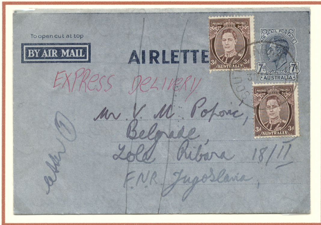
Airletter sent per express from South Yarra October 30, 1950 to Belgrade, Yugoslavia.