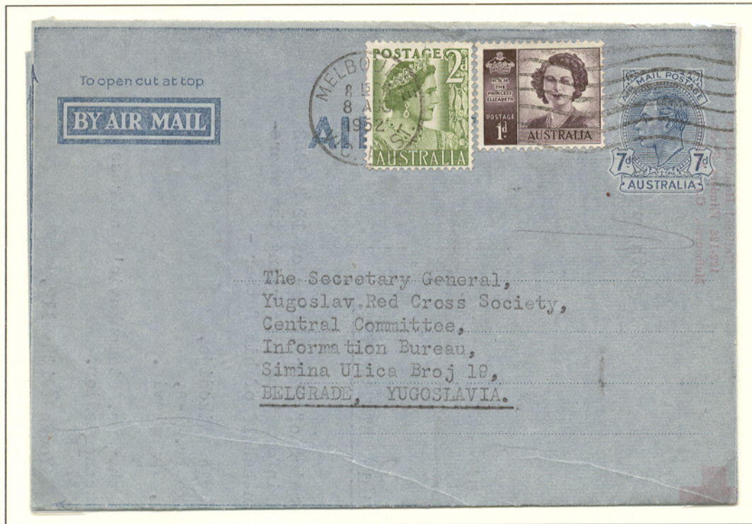
Airletter sent by the Red Cross from Melbourne August 8, 1952 → Yugoslav Red Cross Society Belgrade, Yugoslavia.