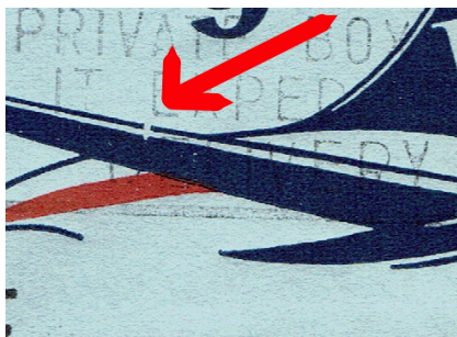
Fig. 2: Detail "Fracture in the wing".

However, there is a special feature here. A closer look reveals the variety "fracture in the left wing". This rare variety - not mentioned in the catalogues of Stein and Roggenkämper - was offered and sold by the Australian dealer T. Weller for 80 A$ in 2017.