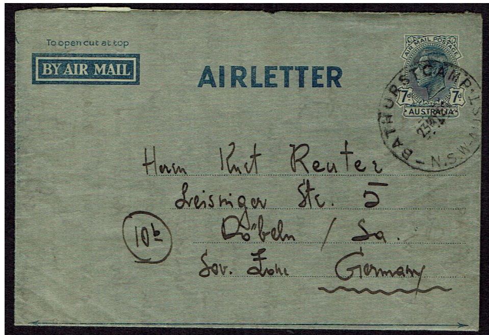
Fig. 3: Airletter from 05.12.1945, sent on 23.05.1945 from BATHURSTCAMP to Döbeln, Germany

An army camp of the Second Australian Imperial Force's 1st Armoured Division was established in Bathurst in 1940. After the war, the camp was used as a "migrant reception and training centre". The first group of migrants arrived in Bathurst in 1948, at times the camp had up to 10,000 inhabitants. The camp had the complete infrastructure of a city, with a hospital and a fully functional post office (see Fig. 4), so the BATHURSTCAMP postmarking should not be uncommon. The camp was closed in 1952. In the place of the former camp there is now an information board about the camp in Limekilns Road, Kelso.