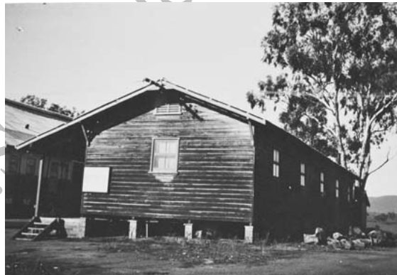
Fig. 3: Post office of the camp

Translated with www.DeepL.com/Translator